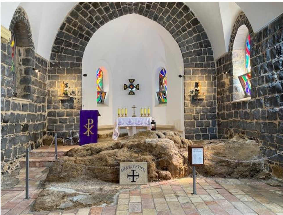
The Church of the primacy of Saint Peter, on the shore of the Sea of Galilee. Jesus ate fish with His disciples on this rock. See John, chapter 21.