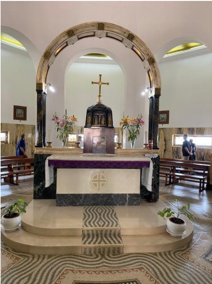
The Church of the Beatitudes