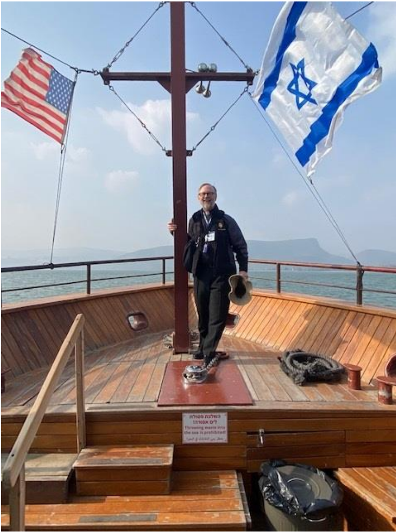
At the bow, the boat on the Sea of Galilee. The boat's captain raised the US Flag and played the National Anthem!