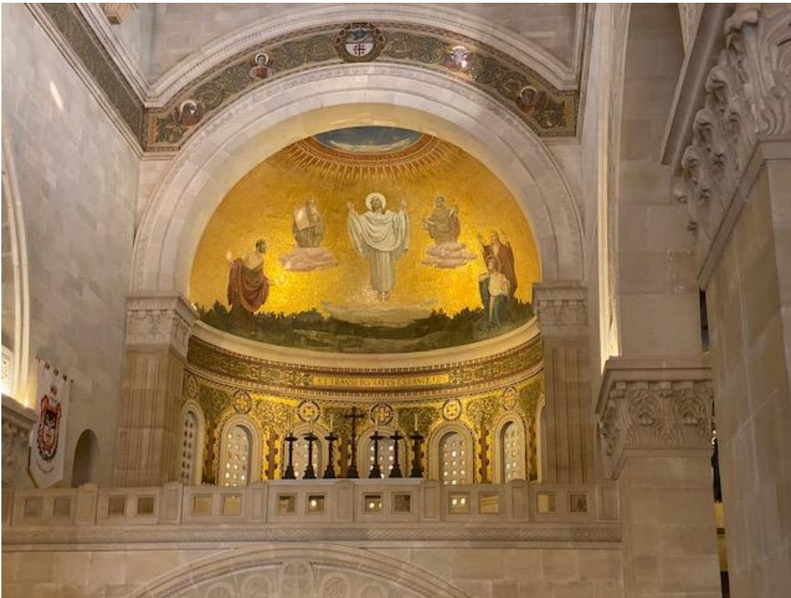
The Church of the Transfiguration