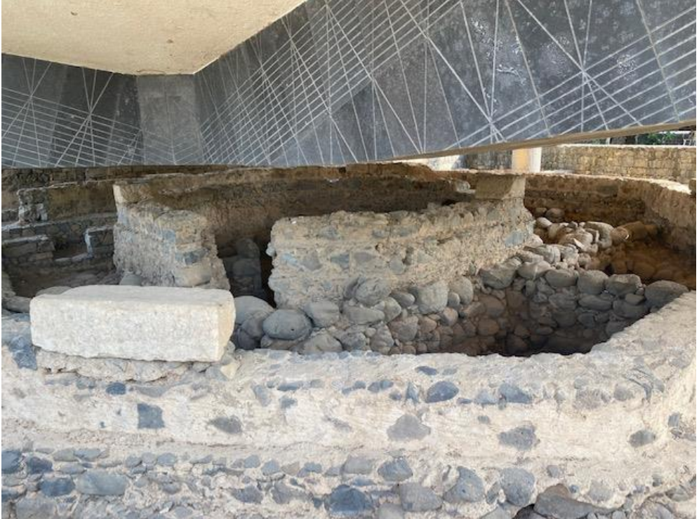
Simon Peters house in Capernaum.