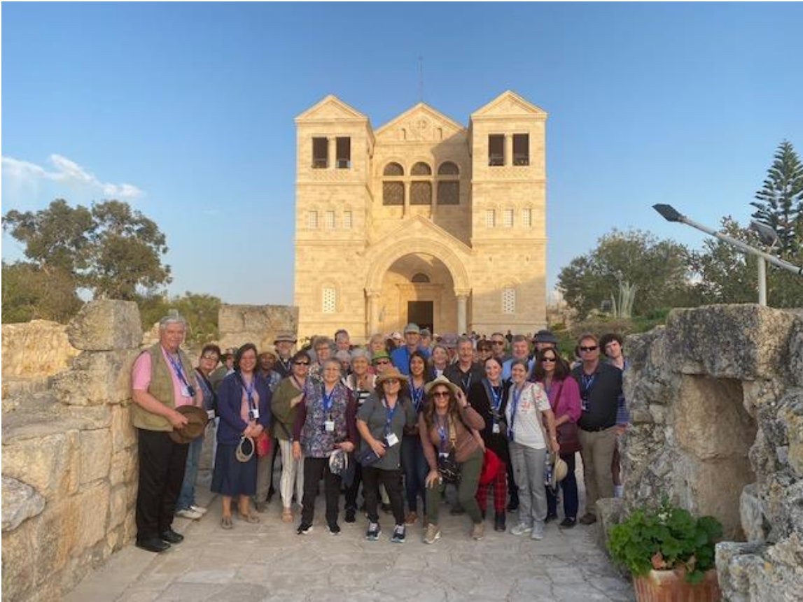
At the Church of the Transfiguration