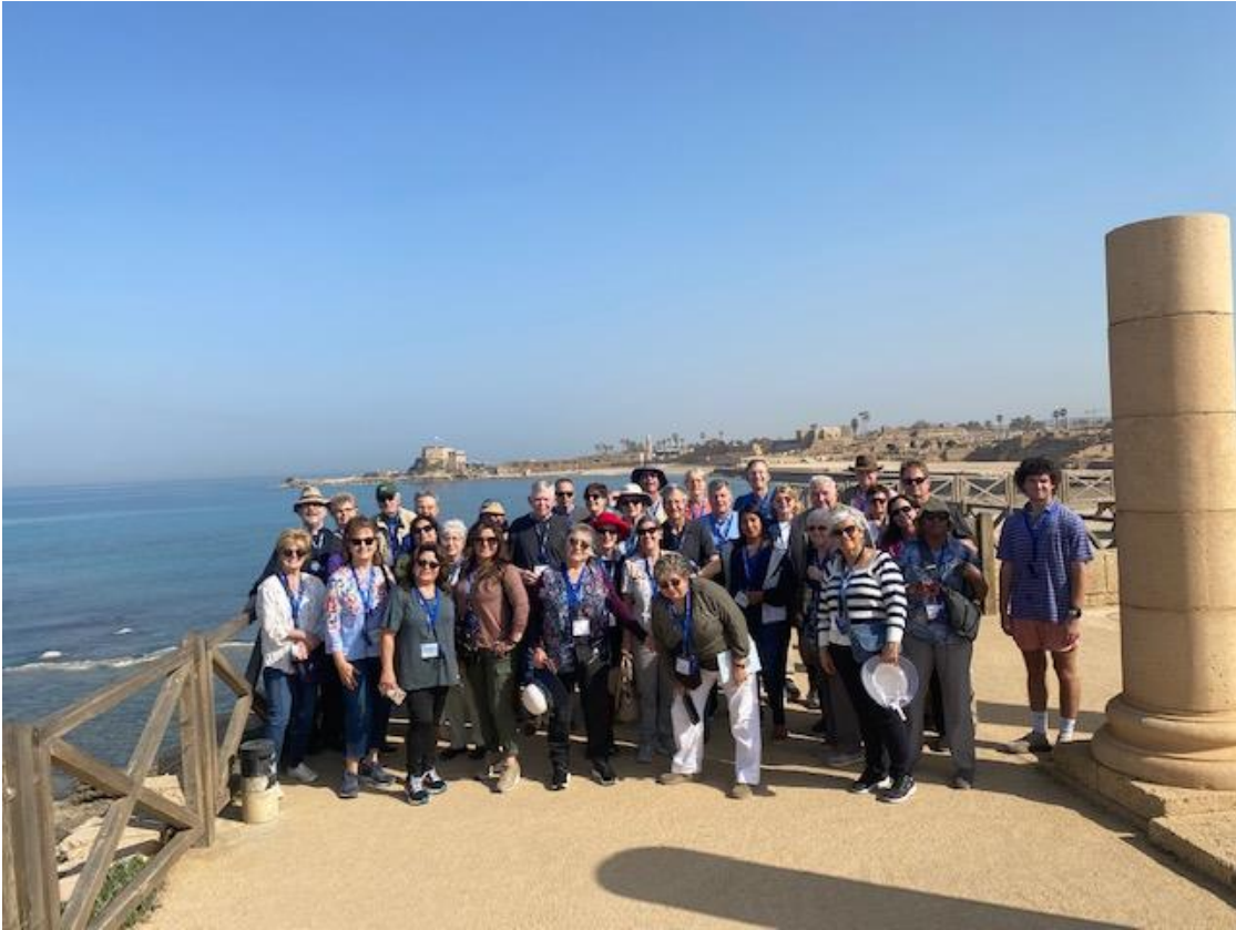
Herod's palace at Caesarea Maritima