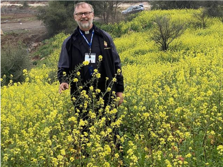
The hills are alive with flowers! This is in route to the Church of the Beatitudes, where Jesus preached the Sermon on the Mount. We celebrated Mass there this morning (3/3/23).