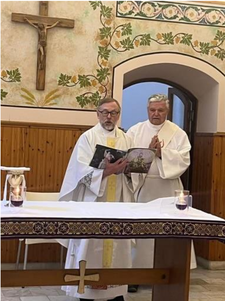
Elijah's cave at Mount Carmel and celebrating Mass at the Chapel of Our Lady of Mount Carmel