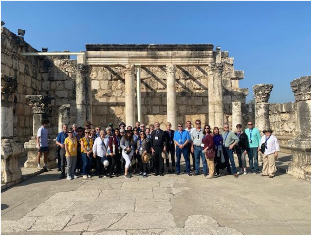
At the synagogue in Capernaum. This is a fourth century synagogue built over the first century synagogue.