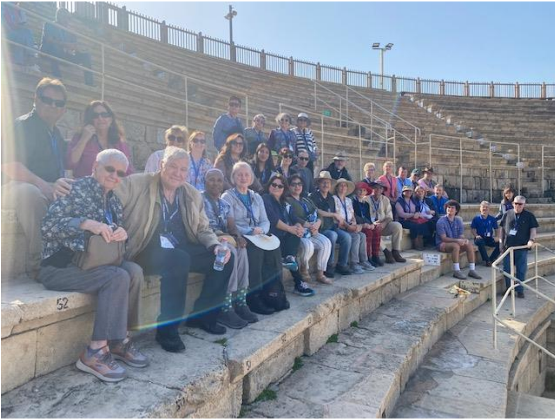
At Caesarea Maritima in the amphitheater